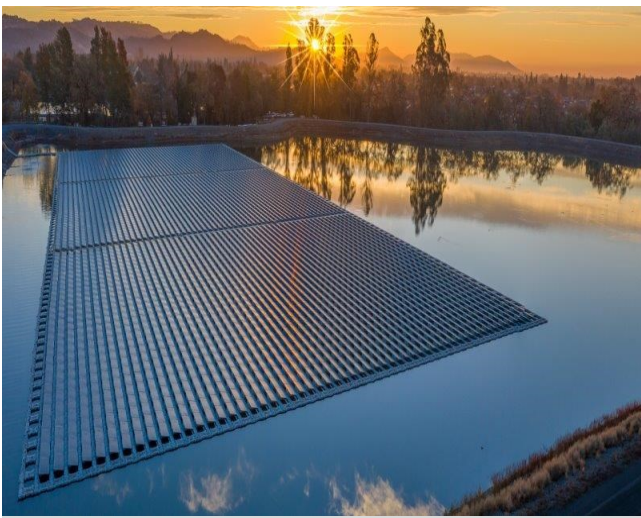
Collins Electric was the general contractor for the 1.8MW floatovoltaic solar power system serving the Windsor, Calif. wastewater treatment facility.

The company has taken part in a number of groundbreaking projects including the Healdsburg Floatovoltaic Solar System, which is the country's largest, as well as the Sonora Courthouse and the UC Davis Medical Group Roseville II Medical Office Building. Work currently underway includes a large